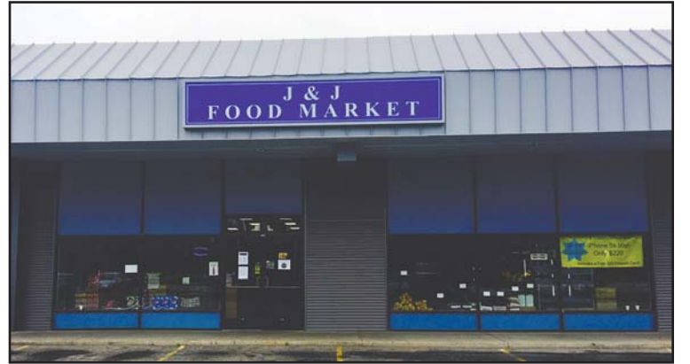
Based in Wasilla, J&J Food Market can be shopped via the web.

J&J Food Market is our first retail store on the road system dedicated to lowering the cost of living for all Alaskans. Located in the Value Village strip mall just past Lucille on the Parks Highway, we offer a full array of groceries and general merchandise items. We try to bring you the best possible costs on every item we sell from gum to hair clippers and farm fresh produce to locally harvested meats. Any deal we get is passed on to the customers. We are here